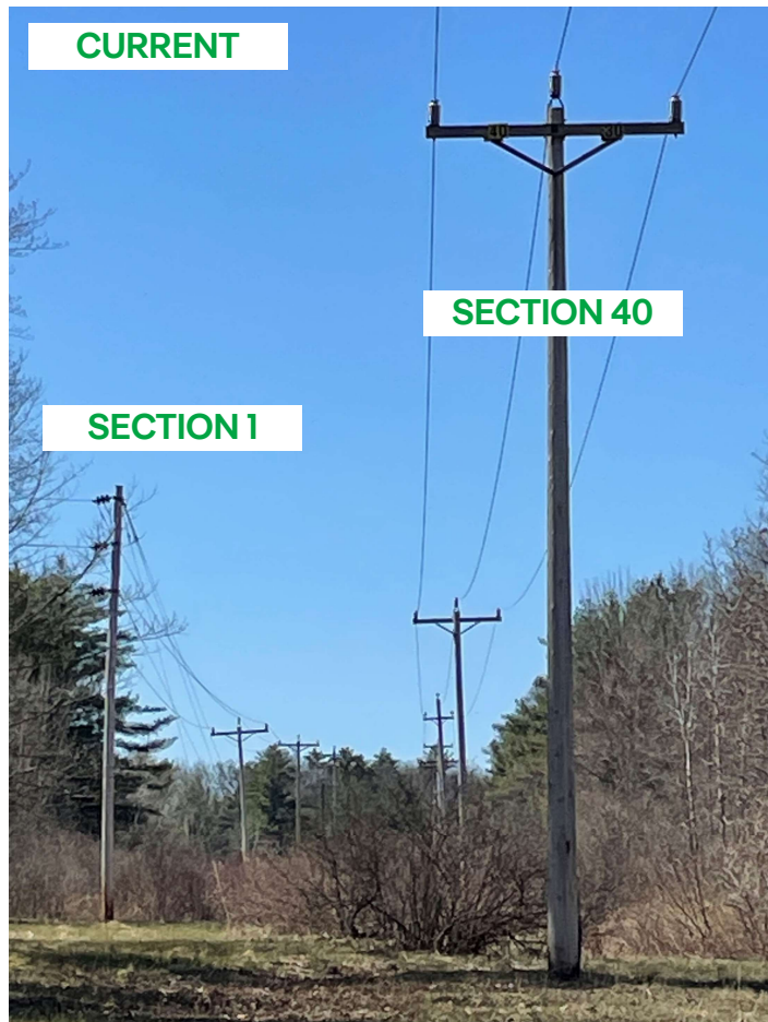
Reroute begins at Smiley Road and Warren Terrace. Single poles. Double circuited.